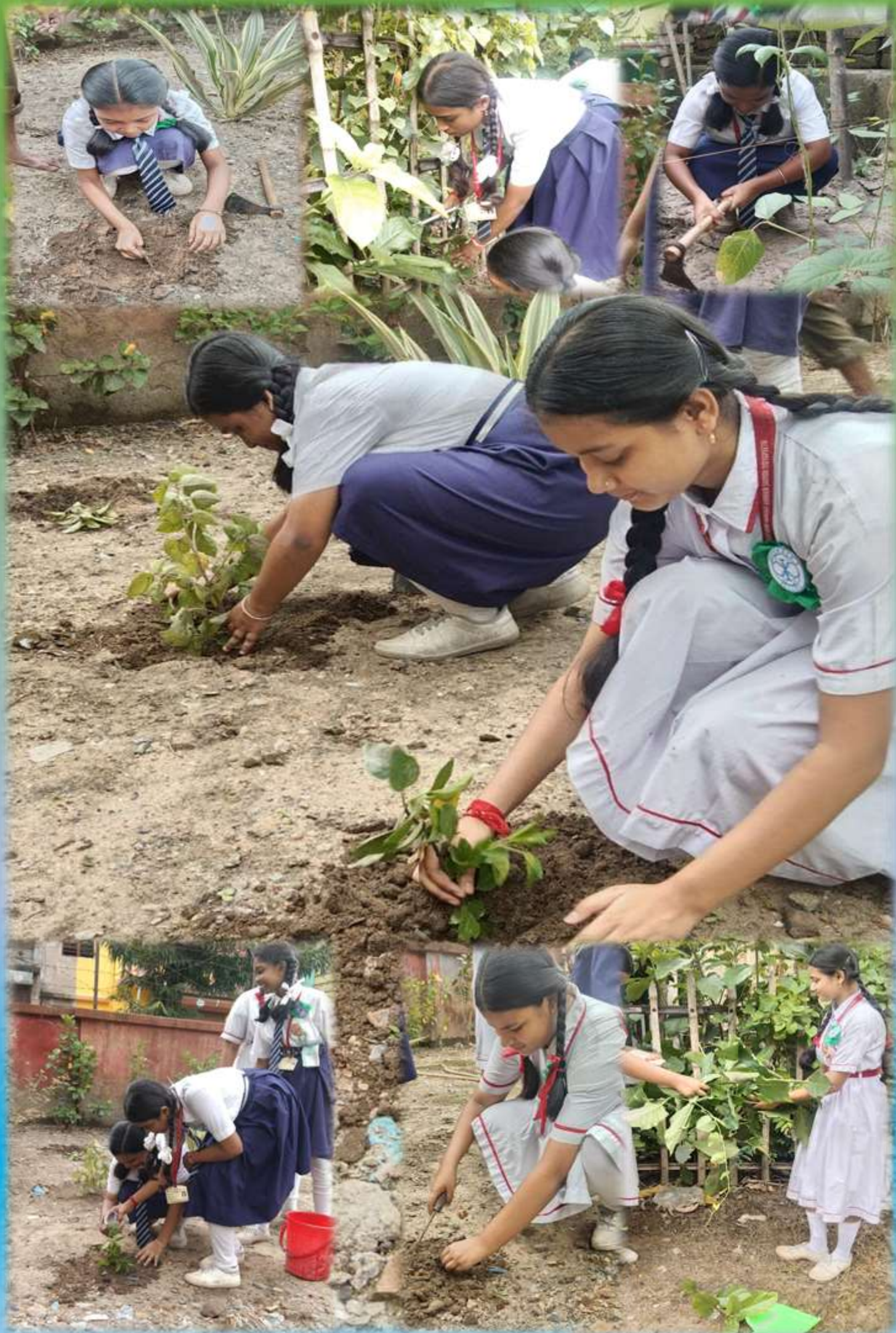
Students of Dumdum Ananda Ashram Balika Vidyapith utilising tools donated by RCCJ to do some in campus kitchen gardening